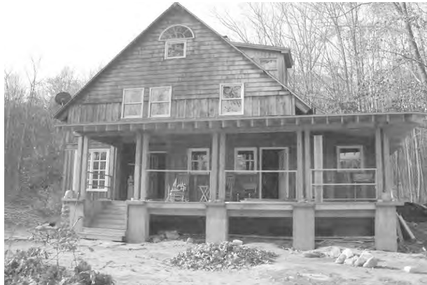
New Agape Porch and Kitchen Extension

Searching for long-term community members who would bring their skills in community building, nonviolence and hospitality, ministry to Agape for an extended time. See our website and call us for more information.